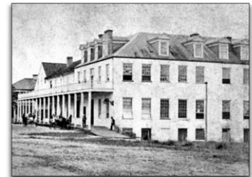
City Hotel (1870-1874)

One cup of butter, two of sugar, three of flour, and four eggs, two tea spoons of cream of Tartar and one of soda, and any seasoning you like.